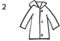
r a n c o a t