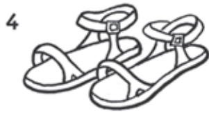
s a n d a l s