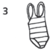
s w i m s u i t