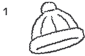
w o o l l y h a t