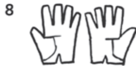
g l o v e s