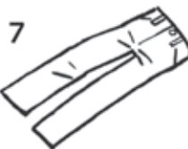
j e n s