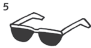
s u n g l a s s